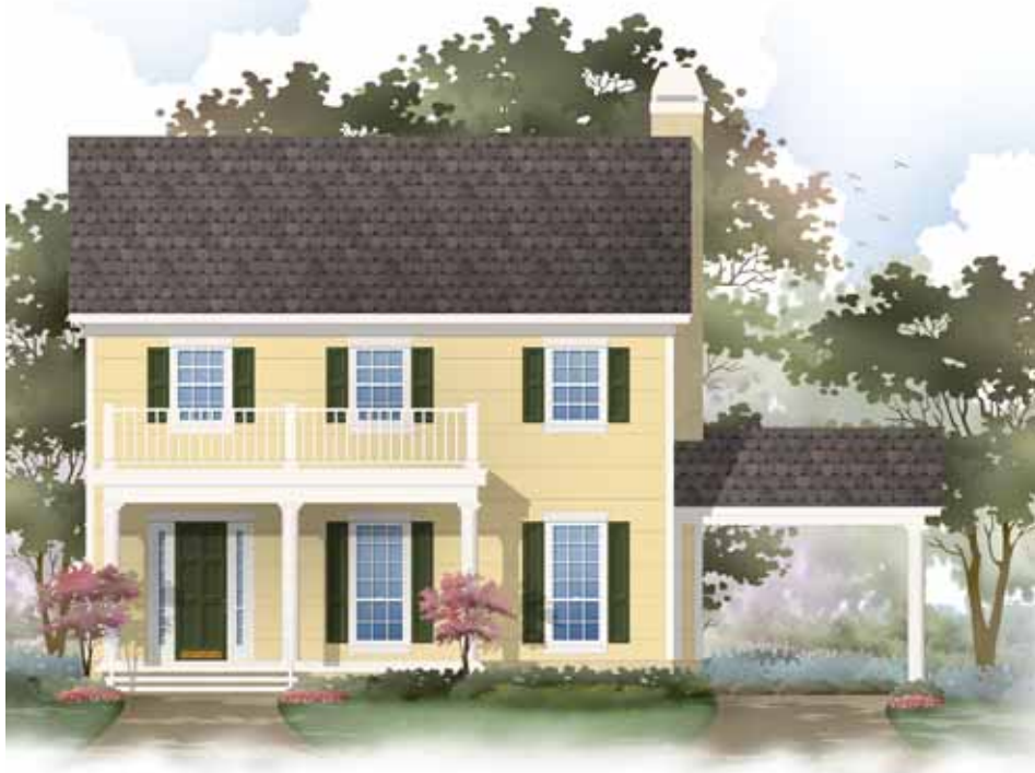
ELEVATION A Shown w/optional Porte Cochere