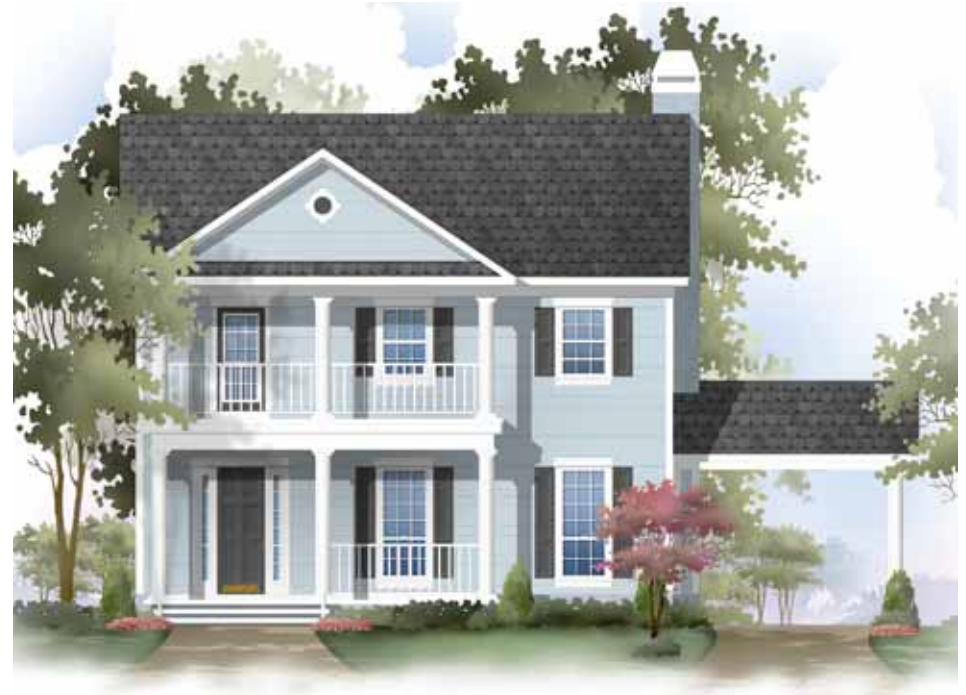
ELEVATION B Shown w/optional Porte Cochere